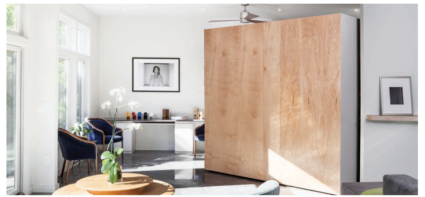
PROJECT Cascadera Residence, Austin, Texas BUILDER RisherMartin Fine Homes, Austin ARCHITECT Steinbomer, Bramwell & Vrazel Architects, Austin